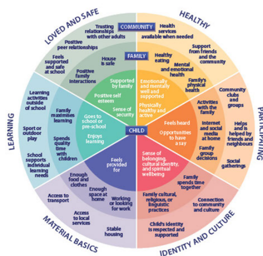
ARACY's Common Approach (Nest) 9